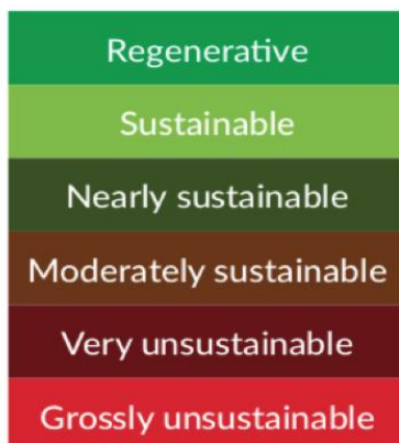
Figure 2: Levels of sustainability

Engineers Australia’s guidelines on implementing sustainability also outline different levels of sustainability (refer Figure 2).